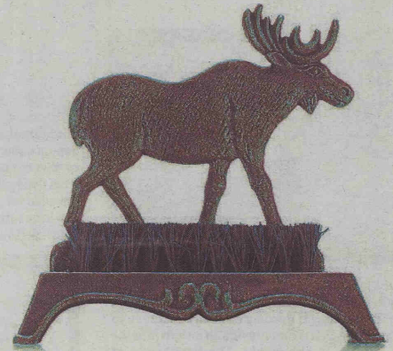
More Wishlist picks overleaf....

This Moose boot scraper conjures up images of snow-caked wellies stomping in after a good ole snowball fight. It would work as well in boring old Irish mud. €27 from Next.