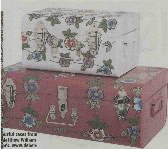
Colorful cases from Matthew Williams. www.deben-

This Moose boot scraper conjures up images of snow-caked wellies stomping in after a good ole snowball fight. It would work as well in boring old Irish mud. €27 from Next.